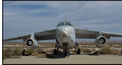
135434 at Edwards