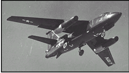
125412 First Flight