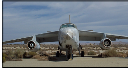
135434 at Edwards