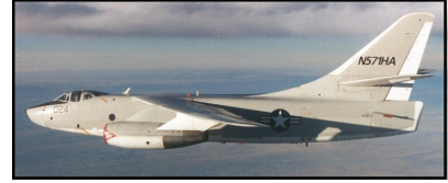
144843 Last Raytheon Flt 1998

Yes, I want to help with the current relocation and restoration project of RA-3B 144843 to Castle Air Museum. You can count on my monetary, volunteer, or in-kind donation as indicated below.