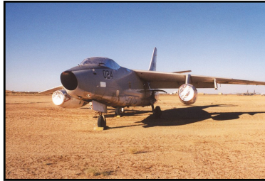
144843 Mojave, CA—2009